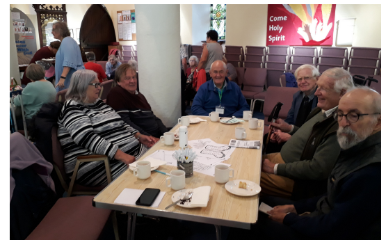
'Connections' Place of Welcome at Holy Trinity, Southwell

"If only one person came it would be worth the effort as it makes such a difference to people who are lonely /isolated" (A Volunteer)